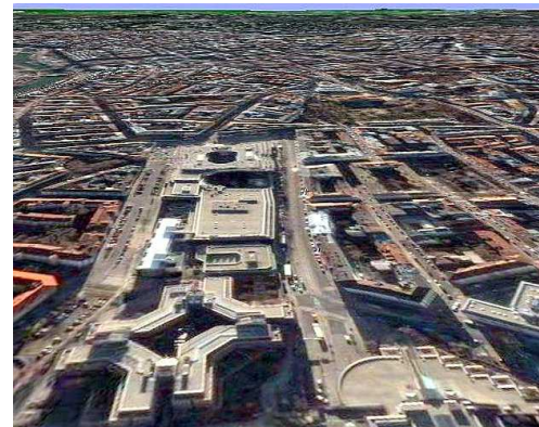
RUW-Nordbergstrasse 15 (UZA 4) with view to Historic 1 st District/Ringstrasse